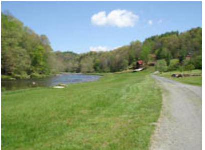
Riverfront Common Areas

Priced for QUICK sale! 12.1 acres (7 lots) in quiet subdivision with a common area and river access. All lots are very buildable, wooded (mature, marketable timber) and 3 have a stream. Other lots in this subdivision start at $35,000 per acre. Great opportunity to own mountain land or flip for a profit. Won't last long at this price – take advantage of this great investment opportunity. Broker owned.