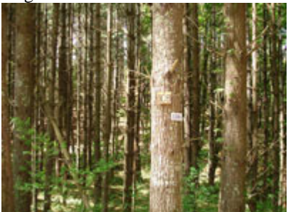
Front of Lot 108