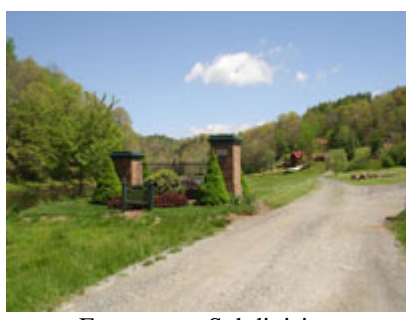
Entrance to Subdivision

Notes: Will sub-divide, shown by appointment only