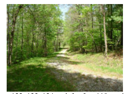
Lots 122, 123, 124 on left – Lot 110 on right