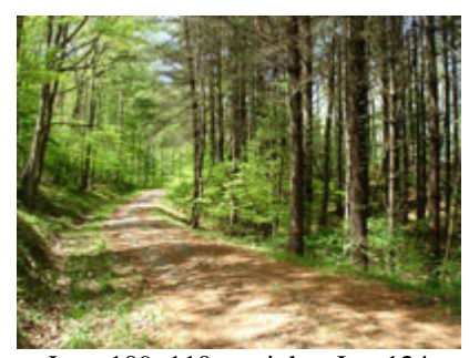
Lots 109, 110 on right - Lot 124

Priced for QUICK sale! 12.1 acres (7 lots) in quiet subdivision with a common area and river access. All lots are very buildable, wooded (mature, marketable timber) and 3 have a stream. Other lots in this subdivision start at $35,000 per acre. Great opportunity to own mountain land or flip for a profit. Won't last long at this price – take advantage of this great investment opportunity. Broker owned.