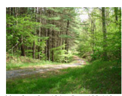
Looking from Lot 124 to Lots 108-110 on left