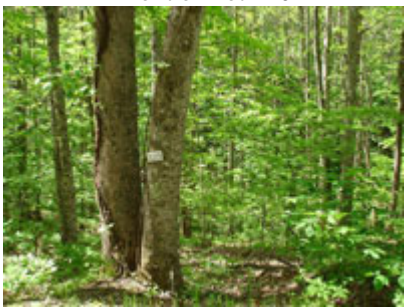
Front of Lot 123