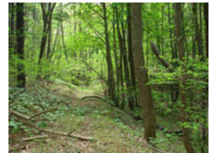
Interior Wood Road on 5.3 acre Lot 124