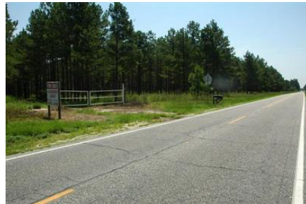
Entrance gate and road frontage on Rennert Road.