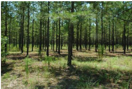
Loblolly Pine near entrance.