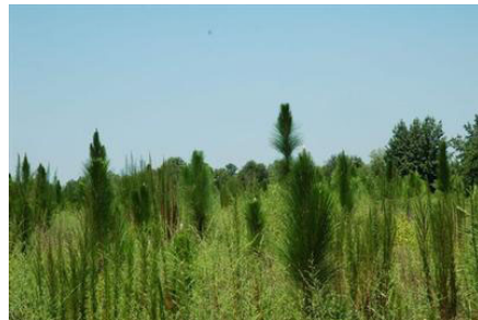
3 Year old Longleaf Pine.