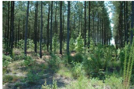
Upland ridge with Loblolly Pine.