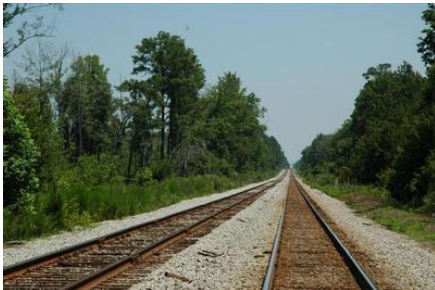
Eastern boundary along railroad.