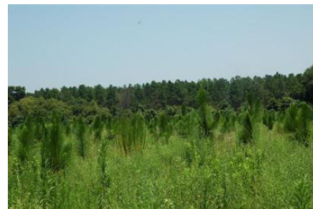
3 Yr Longleaf with 25 Yr Loblolly in background.