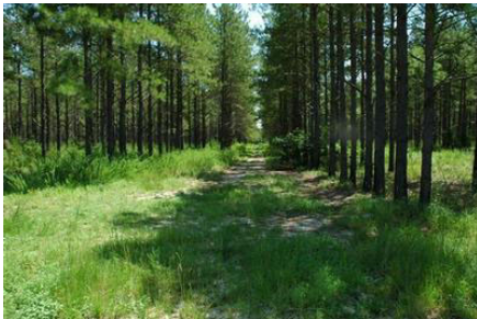
Interior road through Loblolly Pine.