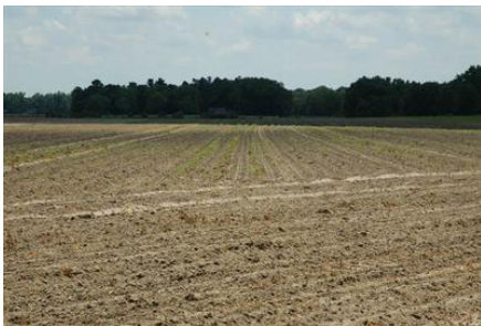
Crops in field.