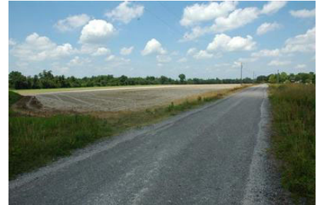
Brickhouse Road, property begins on left.

Size: 148.31 acres Zoning: agricultural Types or Uses: agricultural, estate home, horse farm, hunting Terrain: flat Access: paved road MLS: Tax ID #00337-01-003 Available utilities & Services: electricity, telephone, septic, cable TV, cell service Location: Florence, Florence County, SC 29501 Price: $3,500 per acre ($519,085) Directions: 10 miles to Florence, 14 miles to I-95, and 55 miles to Myrtle Beach, SC Latitude: 34.182571505444841 Longitude: -79.597449302673340 Notes: Will not sub-divide, shown by appointment only, owner financing available