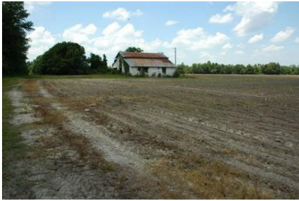
Barn across field.