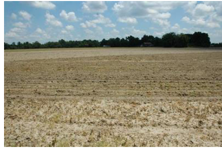
Across field to house and barn.